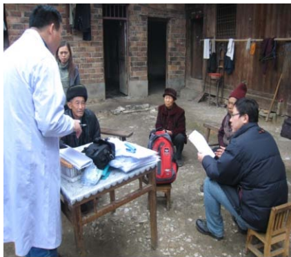
China's Ministry of Health and Ministry of Agriculture are conducting joint epidemiological investigations Highly Pathogenic Avian Influenza.